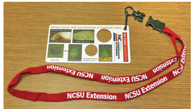
Figure 3. Lanyard with a quick disconnect for removing the aid to measure boll diameter.

The measuring holes provide cotton scouts with an efficient way to select correctly sized bolls. Scouts should target bolls with an outside diameter between 0.9 to 1.1 inches. Bolls of this size are best correlated with recent stink bug damage.