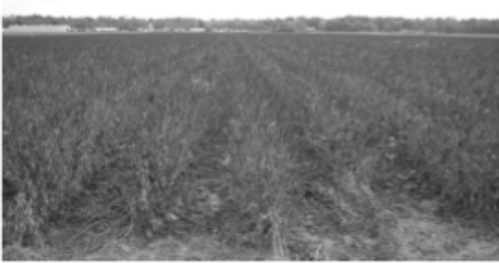
Figure 3. Severe defoliation caused by Cercospora leaf blight.