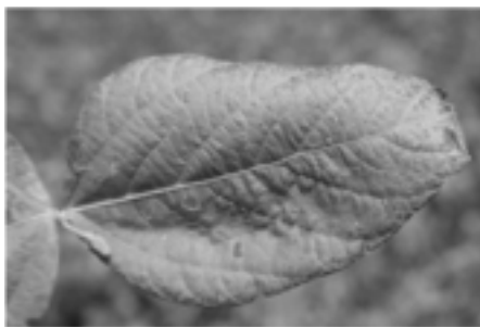
Figure 1. Purple/bronze symptom of Cercospora leaf blight.