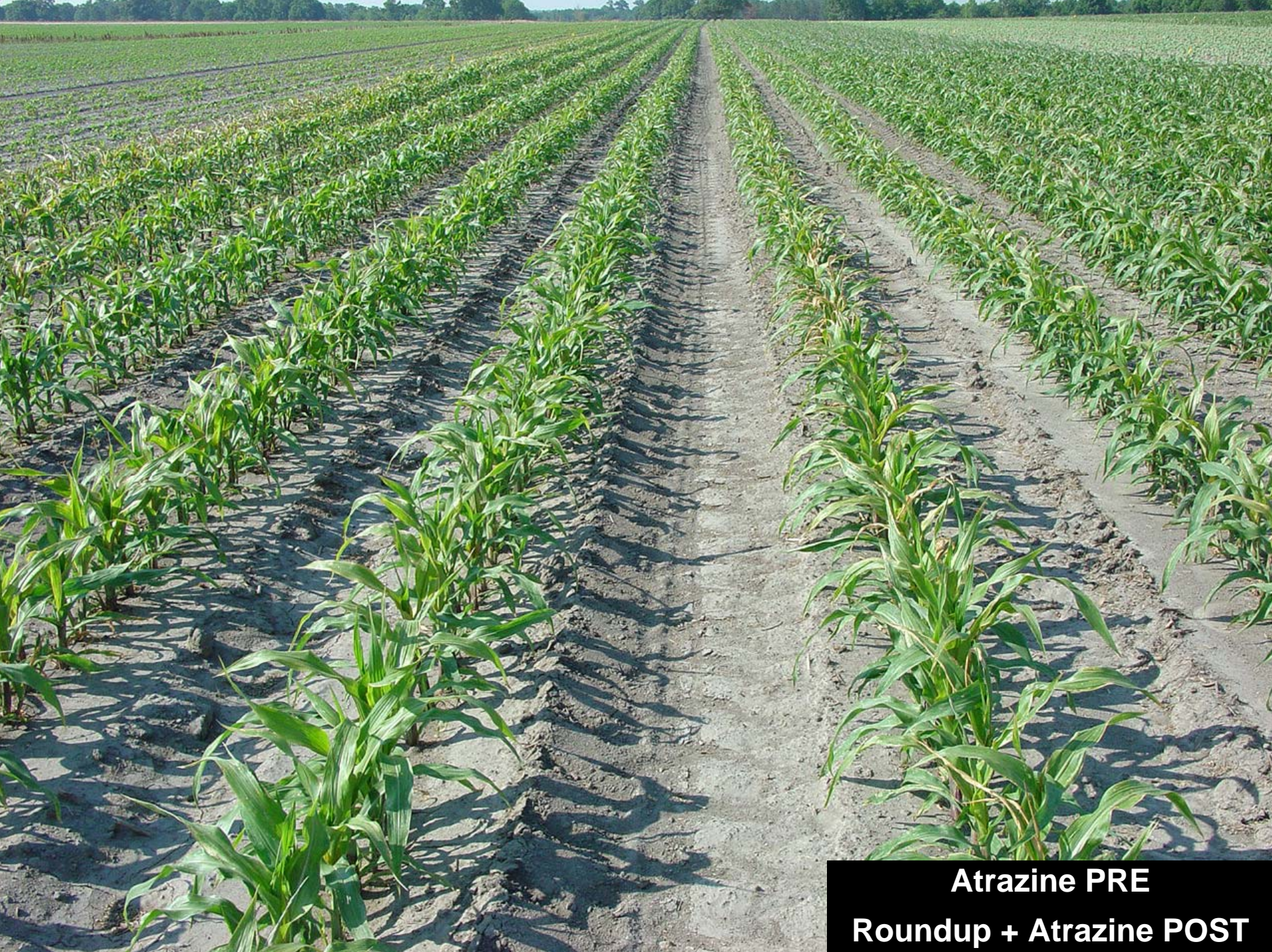
Atrazine PRE Roundup + Atrazine POST