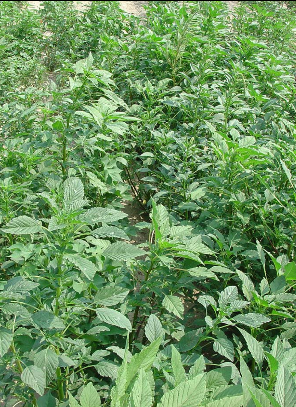
Prowl PRE, Roundup POST Twice