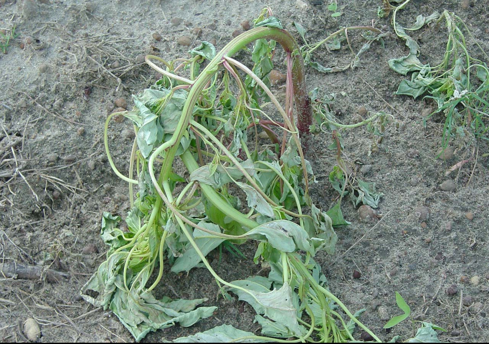
WeatherMax 22 oz, 2 d after application to 16 inch Palmer