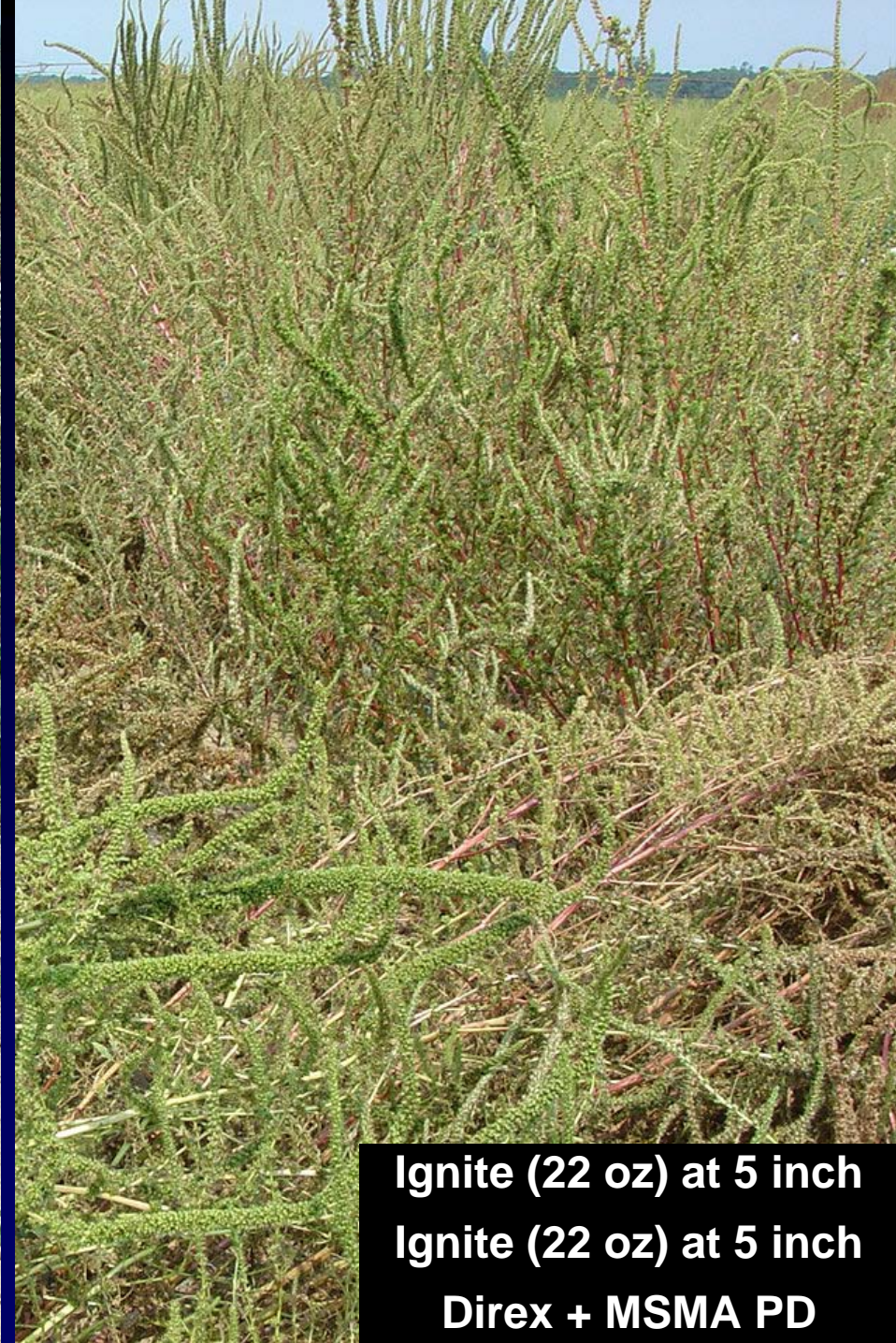
Ignite (22 oz) at 5 inch Ignite (22 oz) at 5 inch Direx + MSMA PD