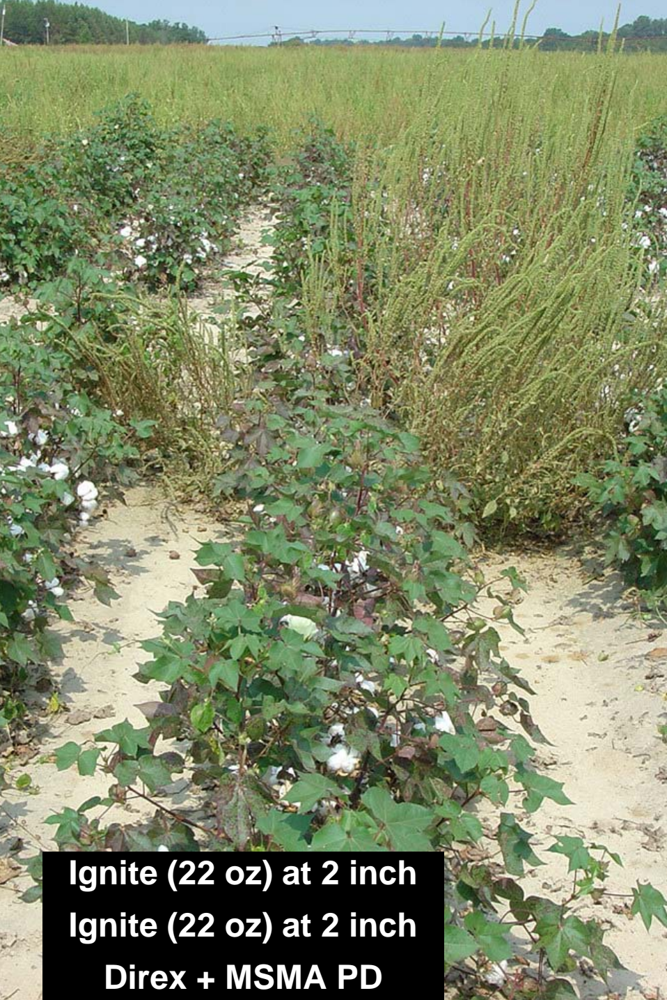
Ignite (22 oz) at 2 inch Ignite (22 oz) at 2 inch Direx + MSMA PD